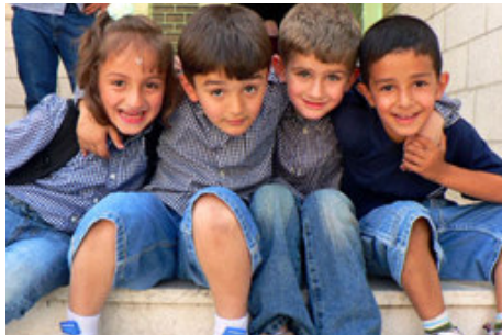
JERUSALEM REGION AND ELCJHL MINISTRIES

The ELCJHL seeks to create hope in a hopeless world through its congregational and educational ministries such as youth and women's programs, science fairs, music and arts programs, teaching economic empowerment and olive-picking with the Environmental Education Center.