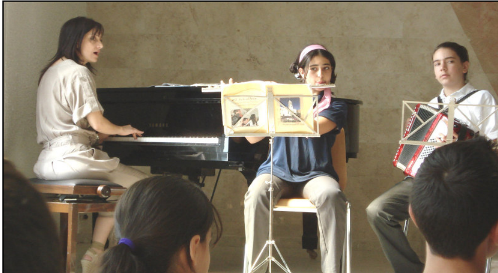
MUSICIANS at Talitha Kumi School contributed their skills to the ELCJHL schools' annual Reformation Day celebration, held on Oct. 29, 2009, at the in Beit Jala school.