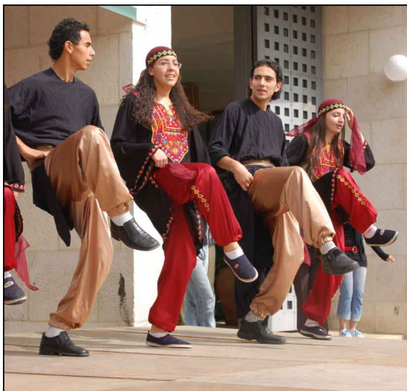
Schools, from p. 3

school are functioning, folk dance groups are practicing and performing, and choral and vocal music classes are important parts of the program. Through its varied activities, the Lutheran schools hope to reflect the philosophy of the Reformation by building community schools for educated and godly citizens and by creating responsible leaders to meet the needs of today's Palestinian society.