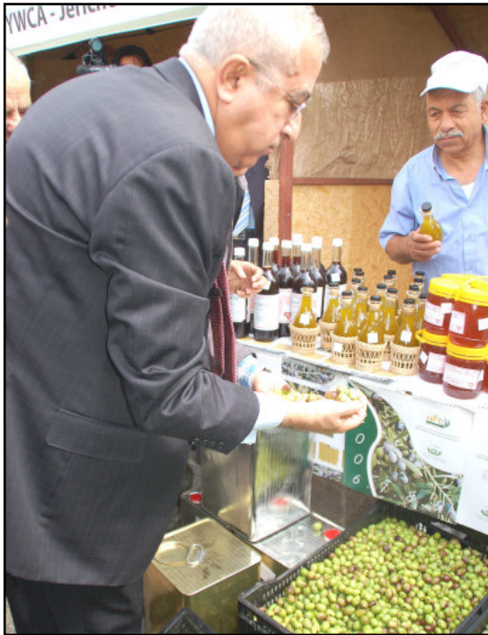
Palestinian Prime Minister Salam Fayyad, at left, inspects olives at the Olive Harvest Festival in Bethlehem.

This year's Olive Harvest Festival in Bethlehem was an exciting and memorable event, which made national news because of the appearance of Prime